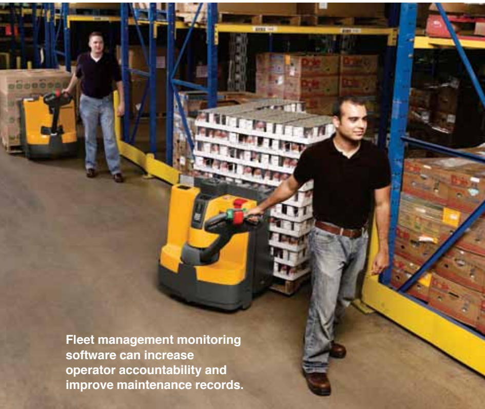
Fleet management monitoring software can increase operator accountability and improve maintenance records.

“They know there are opportunities, but they don’t know where to find them,” says Schwieterman. “You want a tool that is going to be able to capture as much data as possible, from safety to utilization, to service and personnel. Then you need to streamline the information and adopt processes among the management and staff.”