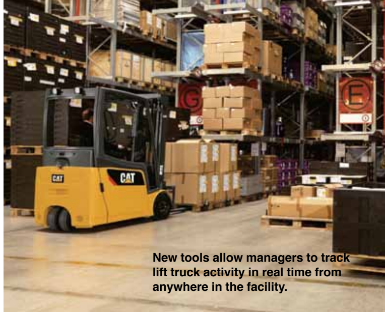
New tools allow managers to track lift truck activity in real time from anywhere in the facility.

management program should strive to make continual improvements every year in utilization and cost. Every warehouse and DC is different, he says, but every site can improve: "It's a living thing. You have to stop and say, how can we do it better?"