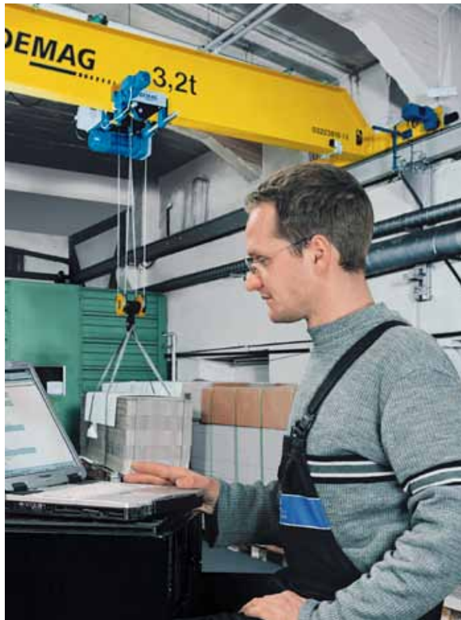
Automated overhead handling systems use software to communicate the direction and movement of the load.

Chain hoists are also manually activated. An operator starts the electric motor that turns a set of gears, which then turns a lift wheel. Pockets in the lift wheel engage the links of the chain that raise the load as the chain rides over the wheel. The chain coming off the wheel either hangs or is collected in a container below the hoist. Chain hoists range in capacity from 250 pounds up to about 20 tons. They are slower than their wire rope hoist counterparts, smaller and more maneuverable.